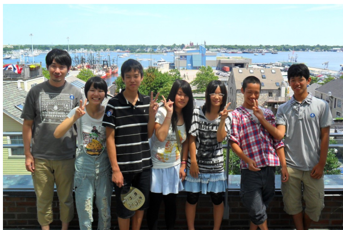
Six Shimizu High School students and their teacher visit the New Bedford Whaling Museum during their July homestay with local area host families